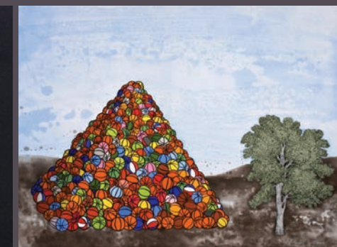
David Huffman, Basketball Pyramid, 2007, Color aquatint, spit bite, sugar lift, soft ground, and hard ground etching, 41.5 x 49, Edition 12/35

*For exhibition related programming, see page 4.