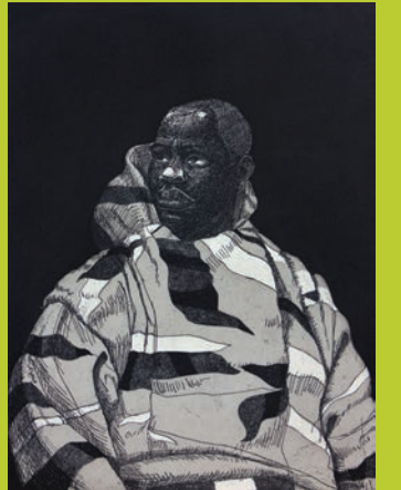
Kerry James Marshall, Untitled, (Handsome Young Man) , 2010, hard ground etching with aquatint, 24.5 x 19 in., courtesy of Paulson Fontaine Press, Berkeley, CA

This exhibition features works by African American artists who have helped to shape the contemporary art conversation in the Bay Area and beyond. The show covers a wide range of prints that include an array of abstract and formal imagery. Narratives that speak to personal experiences and political perspectives are woven throughout.