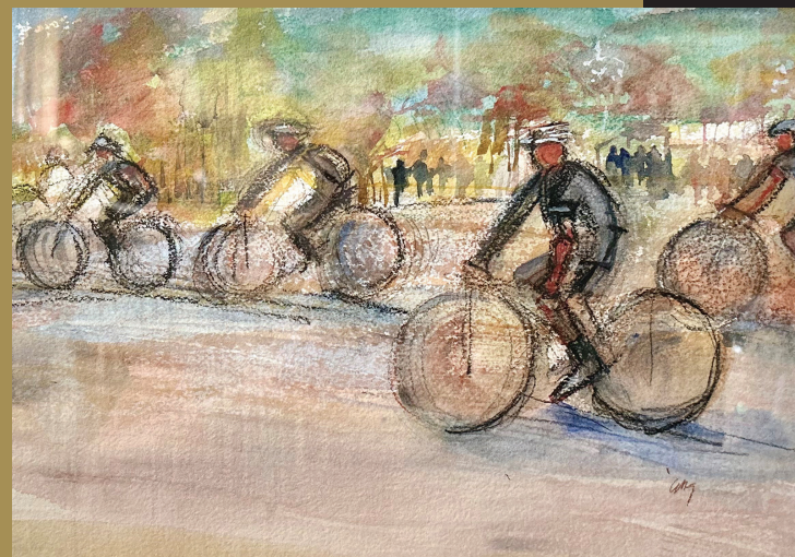
Priscilla Meyermann, Dirty Wooden Shoe Race Start Up , Mixed media

*one drawing per person, duplicates will not be entered.