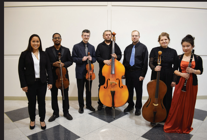
Iowa Chamber Music Collective